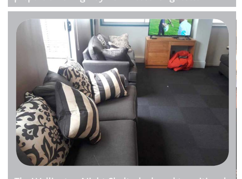
The Wellington Night Shelter's shared transitional accommodation spaces have undergone a recent refurbishment, funded by community fundraising.