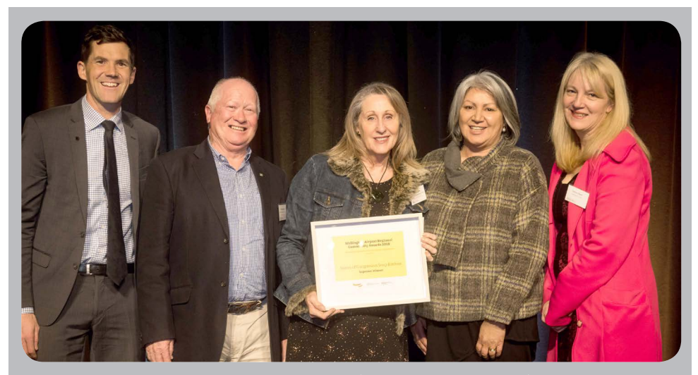
The Soup Kitchen is honoured as the Supreme Winner.

At the 2018 Wellington City Community Awards, the Compassion Soup Kitchen was honoured as the Supreme Winner for its continued commitment to supporting vulnerable people within our community. The Soup Kitchen also won the award for the Health and Well-being category.