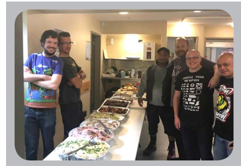
The Wellington Night Shelter volunteers and staff prepare a Boxing Day 2017 feast for guests.

For general Wellington Night Shelter updates and street appeal volunteer call-outs, follow us on the Facebook page: www.facebook.com/WNShelter